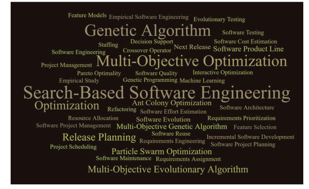
Figure 1: Word cloud for publications devoted to optimization in software engineering since 2000

Using the keywords of 84 optimization related papers published since 2000, a word cloud was created and is presented in Figure 1. We found a diversity of algorithms and concepts. Overall, the highest number of publications is in testing, requirements engineering, and design. This does not imply that there is nothing to optimize in the remaining areas. Lack of proper data might be one reason, and uncertainty in formulating explicit objectives and constraints another one for these current deficits.